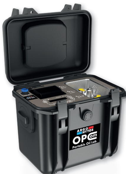
OPCom Portable Oil Lab